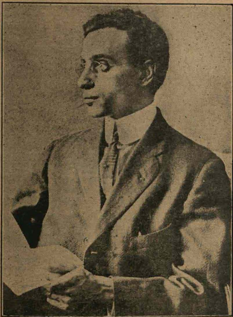
LEO M. FRANK, the Accused.