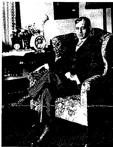
Dorsey's success as prosecutor in the Frank case aided his gubernatorial victory in Georgia in 1916.