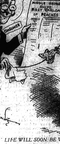
LIFE WILL SOON BE WORTH LIVING