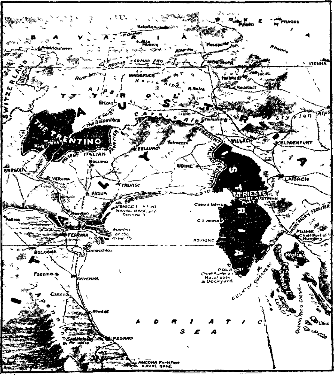
ITALIAN AUSTRIAN BOUNDARY—DISPUTED TERRITORY. The just aspirations of Italy in the historic phrase of Signor Salandra, are shown here at a glance. Italy (irredenta or unredeemed Italy), includes the Trentino and Istria where the Italian race and language largely predominate.

The Trentino consisted of the old bishopric of Trent while Istria formed part of the republic of Venice and was thrown by Napoleon. Subsequently, on Napoleon's downfall both Istria and the Trentino passed into the hands of Austria. In 1866 when Austria was compelled to give up the province of Venice she retained both Istria and the Trentino and ever since the unredeemed provinces have been a rankling wound in the side of Italy.