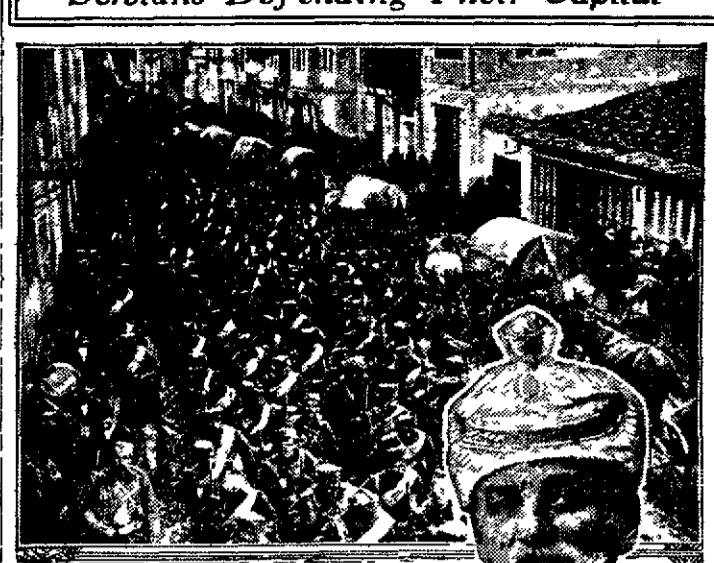
SERBIAN INFANTRY AT BELGRADE, KING PETER.

Bombardment of Belgrade, the Serbian capital, has been resumed by the Austrians and Germans with large caliber howitzers, according to an official statement issued at Nish and quickly telegraphed by the Reuter correspondent.